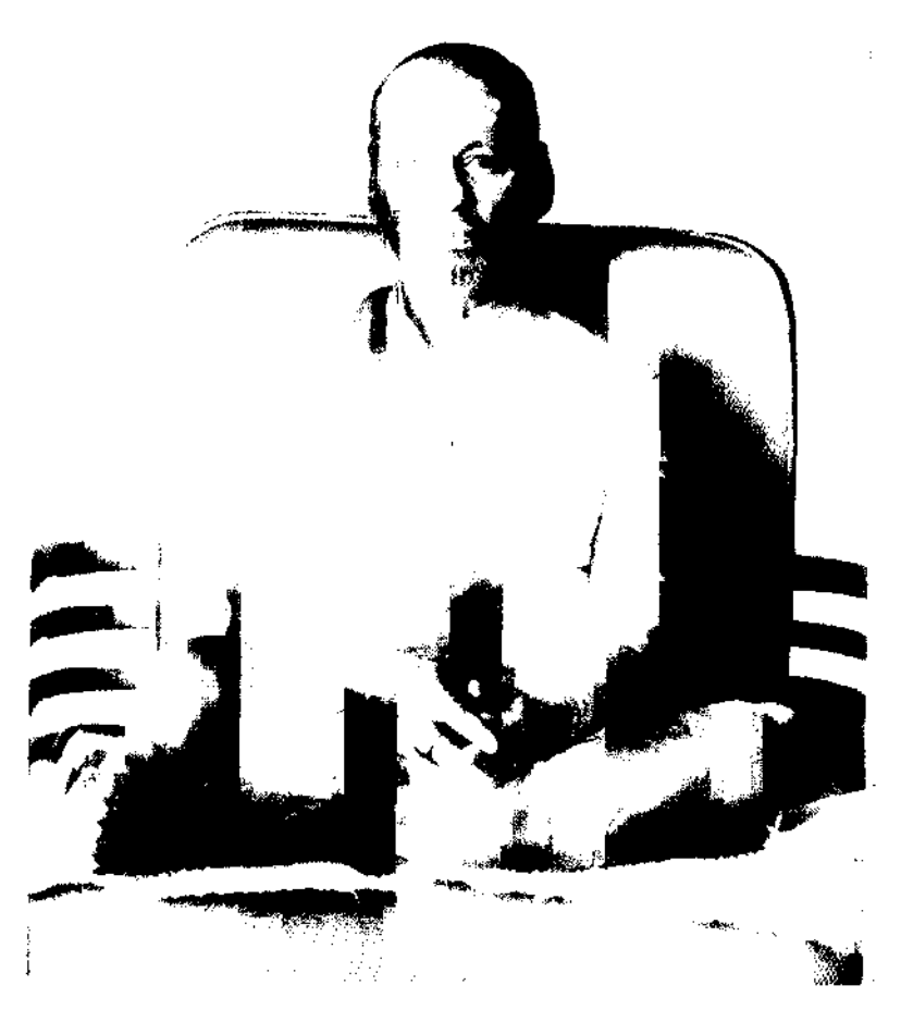
Sadguru Swami Muktananda