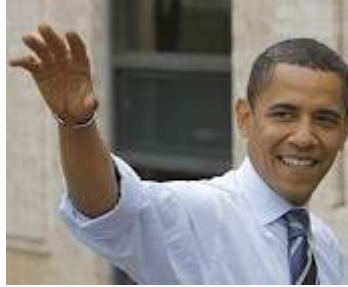
Senator Barack Obama

We need not go into details or add to the media saturation of the past months; all the sordid information and vile tactics in the race for the leadership of the vilest nation on earth have been served to us for breakfast, lunch and dinner, ad nauseam!