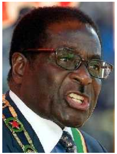
Mugabe, mass murderer and torturer

\underline{http://www.smh.com.au/articles/2008/06/21/1214009142528.html}