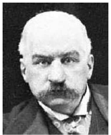
J P Morgan, pioneer Banker-thief

\frac{http://www.economist.com/displaystory.cfm?story\_id=11825979\&CFID=15232381\&CFTOKEN=96941748}{41748}