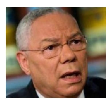
Republican Colin Powell endorses Democrat Obama

As mindless Americans obsess over the STAGED race for the presidency they tend to overlook the simple fact that a two party system that requires hundreds of millions of dollars to function is the farthest thing from democratic process imaginable! A definition may be required for the Paris Hiltons of this world: DEMOCRACY is simply MAJORITY RULE via representative government – I lament the number of times this simple definition must be repeated!