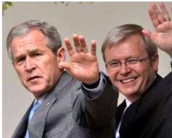
The dunce and the pipsqueak, respectively!

Whatever happened to moral leadership in America - if it ever existed? Not a peep from Obama, the black marionette president elect, regarding actions against Cheney, who is without peer as the most culpable criminal of the 21st century - not forgetting the crimes of Bush and other senior members of the regime!