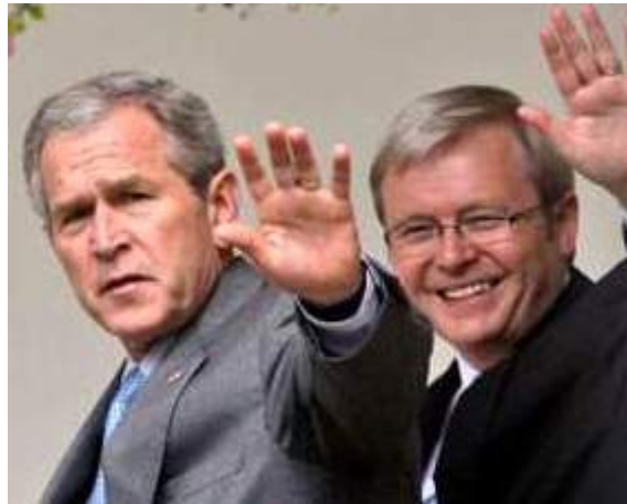
The dunce and the pipsqueak, respectively!

Whatever happened to moral leadership in America - if it ever existed? Not a peep from Obama, the black marionette president elect, regarding actions against Cheney, who is without peer as the most culpable criminal of the 21st century - not forgetting the crimes of Bush and other senior members of the regime!