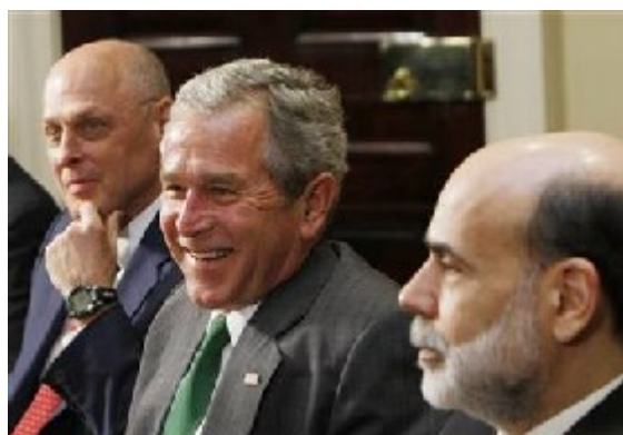
'We the Banksters ..'

Cleaves Alternative News. http://cleaves.lingama.net/news/story-1327.html