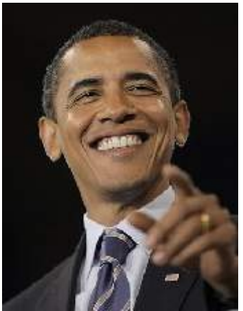
Barack O' Watermelon

http://www.upi.com/Top_News/2008/12/11/Report_blames_Rumsfeld_for_torture/UPI-422712290242 30/