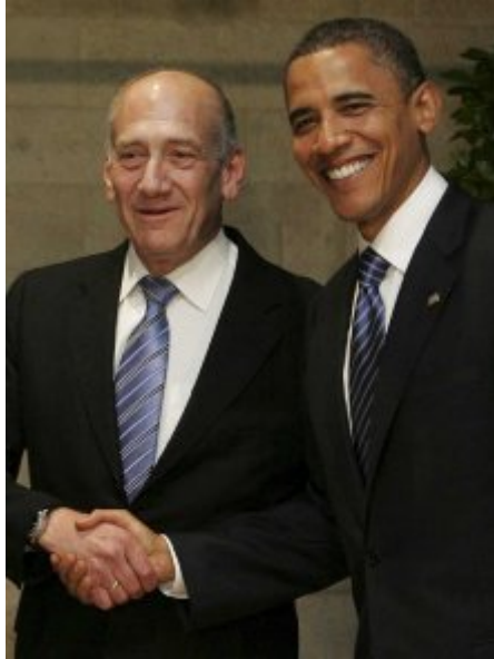
Olmert and Obama