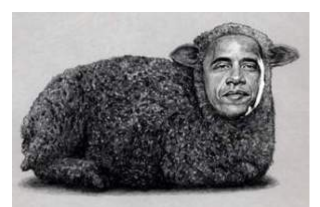
Fearless leadership and integrity in Washington

Cleaves Alternative News. http://cleaves.lingama.net/news/story-1426.html