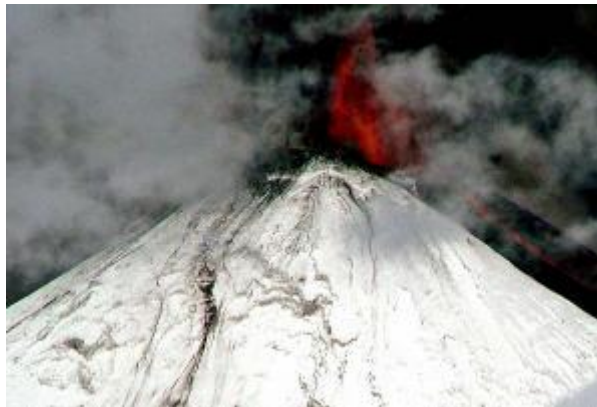
Chile's Llaima volcano erupts

We predicted a chain reaction of volcanic events after the Tonga deep sea eruption. We had Alaska almost immediately after, now Chile. There will be more activity North of Australia followed by increased magnitude events along the 'rim.' Think in terms of increasing amplitude waves!