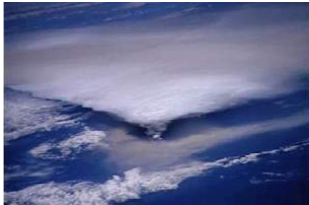
Giant atmospheric plume after last major eruption