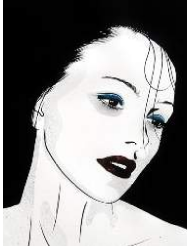
'Clara' by Rone

international / prose/poetry / literature