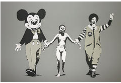
BANKSY -- Coke challenge

Cleaves Alternative News. http://cleaves.lingama.net/news/story-21.html