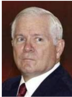
Gates, Sec. of Defense and Corporate LACKEY