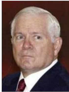
Gates, Sec. of Defense and Corporate LACKEY