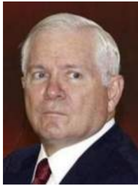
Gates, Sec. of Defense and Corporate LACKEY