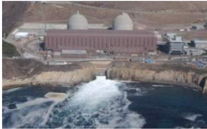
Diablo Canyon reactor, California

We should not forget that the Fukushima reactors are 100 times more powerful than the Chernobyl reactor