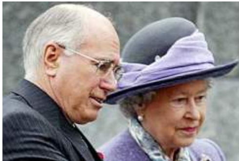
War criminal John Howard with the Queen

Former Australian PM and member of the coalition of willing criminals that invaded Iraq on a pack of lies and deceit, John 'aluminium tubing' Howard, has been awarded the Order of Merit by the Queen of England, whose family has even more innocent blood on their hands than the coalition of willing criminals that illegally invaded Iraq!