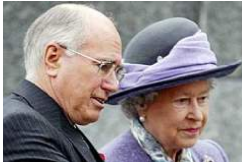
War criminal John Howard with the Queen

Former Australian PM and member of the coalition of willing criminals that invaded Iraq on a pack of lies and deceit, John 'aluminium tubing' Howard, has been awarded the Order of Merit by the Queen of England, whose family has even more innocent blood on their hands than the coalition of willing criminals that illegally invaded Iraq!