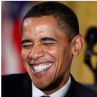
Obama, errand boy

During my university days I studied all forms of fiction, fabulation, metafiction, realism, horror, gothic and personal favourite, fiction of the absurd; but I never imagined I would one day live in a real world of the fantastic and absurd.