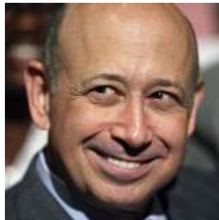
Lloyd Blankfein, CEO Goldman Sachs

There are many disturbing aspects to criminally hijacked America today, not least of which is the very clear attitude the UNREPRESENTATIVE, minority Banker and Corporate ruling elite have toward the rest of the world. Modern criminal America has proven emphatically that it does not wish to share or enter into any equitable arrangement with any other nation or people in any regard whatsoever.