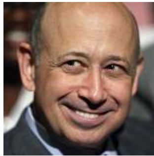
Lloyd Blankfein, CEO Goldman Sachs

There are many disturbing aspects to criminally hijacked America today, not least of which is the very clear attitude the UNREPRESENTATIVE, minority Banker and Corporate ruling elite have toward the rest of the world. Modern criminal America has proven emphatically that it does not wish to share or enter into any equitable arrangement with any other nation or people in any regard whatsoever.