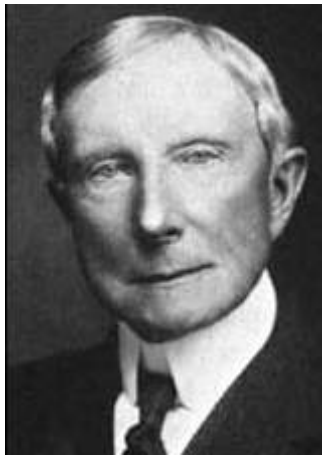
John D Rockefeller, pioneer eugenicist and visionary mass murderer