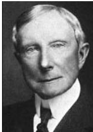
John D Rockefeller, pioneer eugenicist and visionary mass murderer