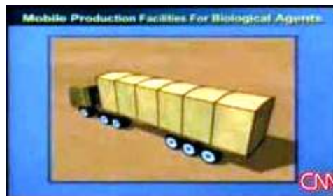
From the corporate 'Crapoganda' media, who else?