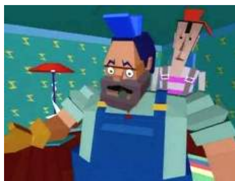
Money for Nothing Vid

http://www.wideasleepinamerica.com/2012/05/this-weekends-extravaganza-of.html