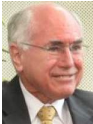
John Howard -- War Criminal and National Disgrace

John Howard, lackey Prime Minister of Australia and member of the coalition of willing criminals, today stated that he is “horrorified” at the loss of life in Iraq. In view of the fact that Howard, Bush and Blair are DIRECTLY responsible for the illegal invasion and the hundreds of thousands of subsequent deaths in Iraq, we are horrified that these men have avoided prosecution to date!