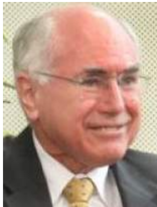
John Howard -- War Criminal and National Disgrace

John Howard, lackey Prime Minister of Australia and member of the coalition of willing criminals, today stated that he is “horrificed” at the loss of life in Iraq. In view of the fact that Howard, Bush and Blair are DIRECTLY responsible for the illegal invasion and the hundreds of thousands of subsequent deaths in Iraq, we are horrified that these men have avoided prosecution to date!