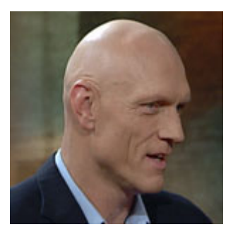
'I don't believe in compromise': Garrett (?)

The USA is that way! The most servile government in Australian history achieved a new 'personal best' in bootlicking today. Yesterday's parliament question time witnessed the Minister of Defence, Brendan (studs) Nelson and the Foreign Minister, Alexander (cream puff) Downer bending over forwards in preparation for Cheney's visit. Astounding as it may seem to most Australians these two lackeys were attempting to score political points by extolling the virtues of neo-colonial subservience to the United States!