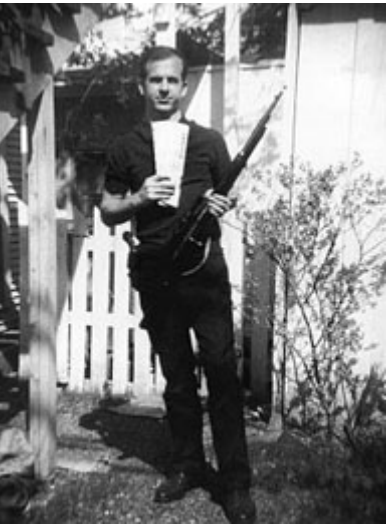
Infamous manual cut and paste photo of Lee Harvey Oswald

http://www.theage.com.au/news/world/im-bali-bomb-mastermind/2007/03/15/1173722612734.html