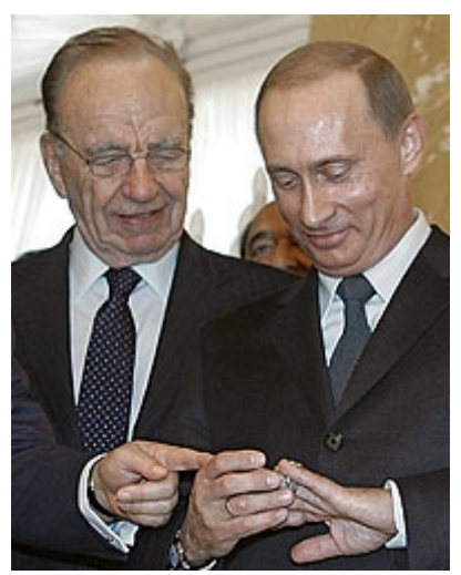
Good 'ol days

Cleaves Alternative News. http://cleaves.lingama.net/news/story-505.html