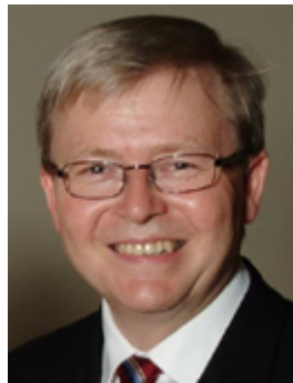
Kevin Rudd -- custard face

The Australian opposition leader Kevin Rudd is proving to be more servile, passive and accommodating than even the current Australian prime minister, John Howard - many would have thought it impossible to top Howard's effort but Rudd has proven them all wrong! Rudd, desperate to please all will eventually please none if he persists with his supremely passive, non-assertive and thoroughly despicable behaviour. It's simply not fitting for an aspiring Australian leader to unashamedly kowtow to the wishes of China over the relatively benign visit of the exiled theocratic leader of Tibet, the Dalai Lama.