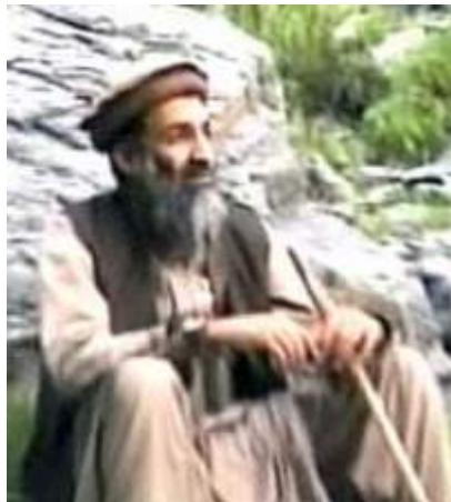
Bin Laden watches his boys in action from the rocks

Perhaps Howard should have payed a few of his faithful supporters a fraction of the amount for the study, for a feigned attack on the Atomic Energy Commission - a guaranteed hysterical public response!