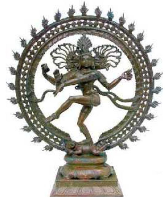
Cosmic flux represented by the dancing God, Nataraj

The accomplished formulate reality and are only affected by Warriors of greater skill. The "ruin" in the introduction refers to insanity – the prize for failing to achieve the 7th level is lunacy. However, do not despair, the USA has proven that lunatics and imbeciles are able to lead nations and affect the reality of others. So you see failure is relative.