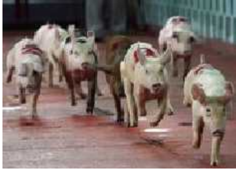
World's leaders -- see how they run!

Cleaves Alternative News. http://cleaves.lingama.net/news/story-740.html