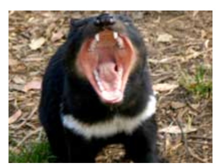
Tasmanian devil - dire prospects