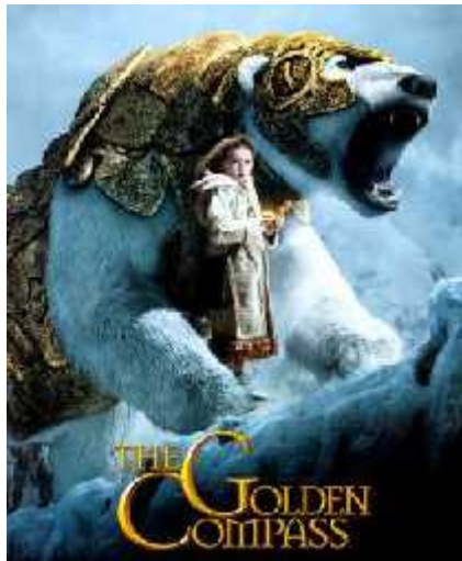
Pullman's novel now a film -- decide for yourself

http://cleaves.zapto.org/news/story-792.html