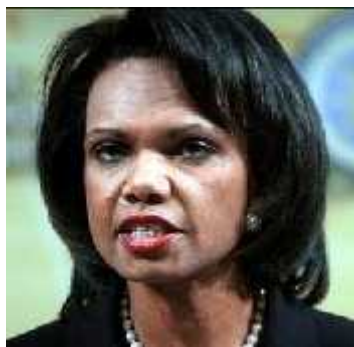
Rice -- child killer and war criminal

Kosovo is legally, morally, and spiritually, Serbian; which part of that simply reality is difficult to understand? Every nation has the legal right to maintain its territorial integrity; what part of that legal reality is difficult to understand? The KLA is an Islamic, criminal, secessionist terrorist organisation -- fact! Nations that support criminal organisations cast themselves as criminal States; recent world history would validate that reality.