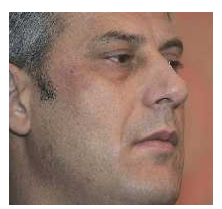
Drug dealer, murderer and American puppet, Hashim Thaci

Cleaves Alternative News. http://cleaves.lingama.net/news/story-950.html