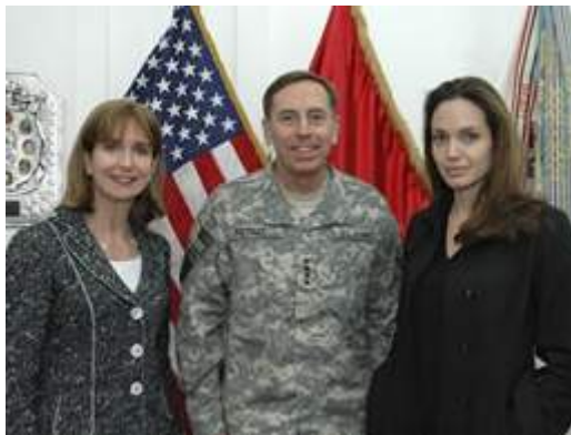
Gen. Patraeus, flags and Angelina Jolie

Today's click on my news aggregator produced a curious item; Angelina Jolie in Iraq pleading with General David Petraeus to assist the millions of Iraqi refugees. Might I assist and remind our ineffective 'pretty little thing' that Rumsfeld made it clear when he stated that American forces are "NOT nation builders" or humanitarians. Carried in the sub-text is the cruel Truth; the American military corps are amphetamine-crazed KILLERS, destroyers, spoilers and TORTURERS -- that is the hard reality.