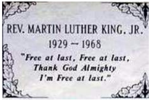
Death = Freedom, I don't think so!

http://www.commondreams.org/view/2012/01/16-5